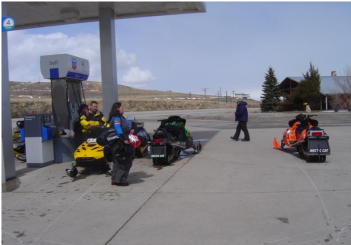
GSSA dedicated snowmobilers....snow or No snow Bear lake

Golden Spike Snowmobile Association December 2009